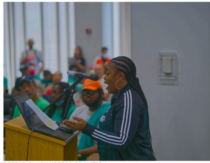
DEFEND BLACK VOTERS COALITION A member of the Defend Black Voters Coalition speaks at a hearing of the Michigan Public Service Commission in Detroit, July 2022

State business and political elites at the Mackinac Policy Conference were challenged by community groups over a Republican plan to pass new restrictions on elections and circumvent a veto from the governor.